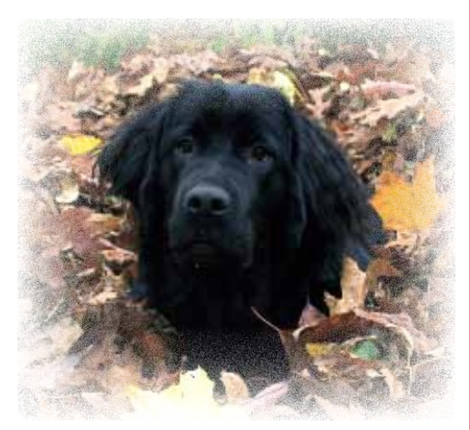
Roxy our new member of the family.